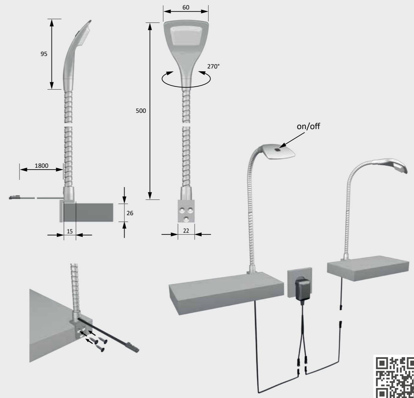
Dimensional drawing / installation